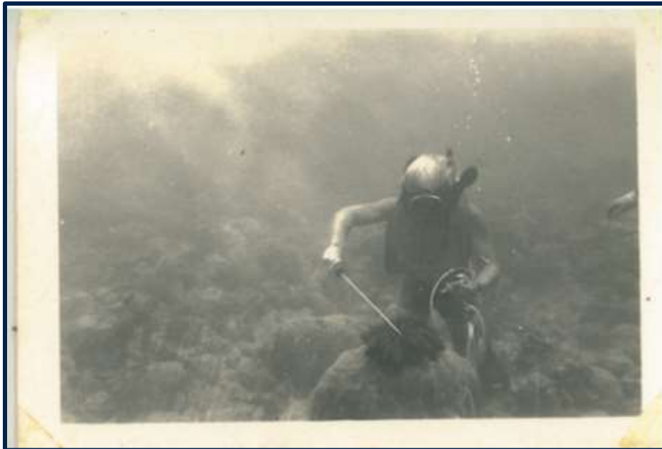
[Left] Historic photograph of a diver removing COTS at 65 ft depth at Catalina Point, Guam 1971.