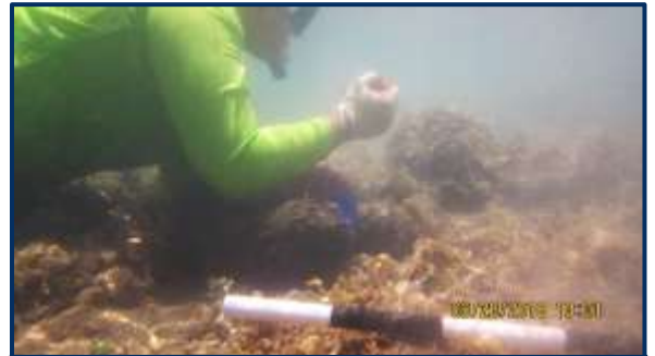
Algal removal proved a challenge – stirring up sediment during removal was common.

So what does all this mean? FOR Guam interns successfully tested a simple algal removal method that may help corals recover from damage and improve fish habitat. FOR Guam hopes to try this at more sites with community members in the future. Algal removal paired with coral reef monitoring surveys will help us assess the balance on our coral reefs over time. Stay tuned for algal removal activities in 2019. For more information, visit us at http://guamreefmonitoring.wordpress.com .